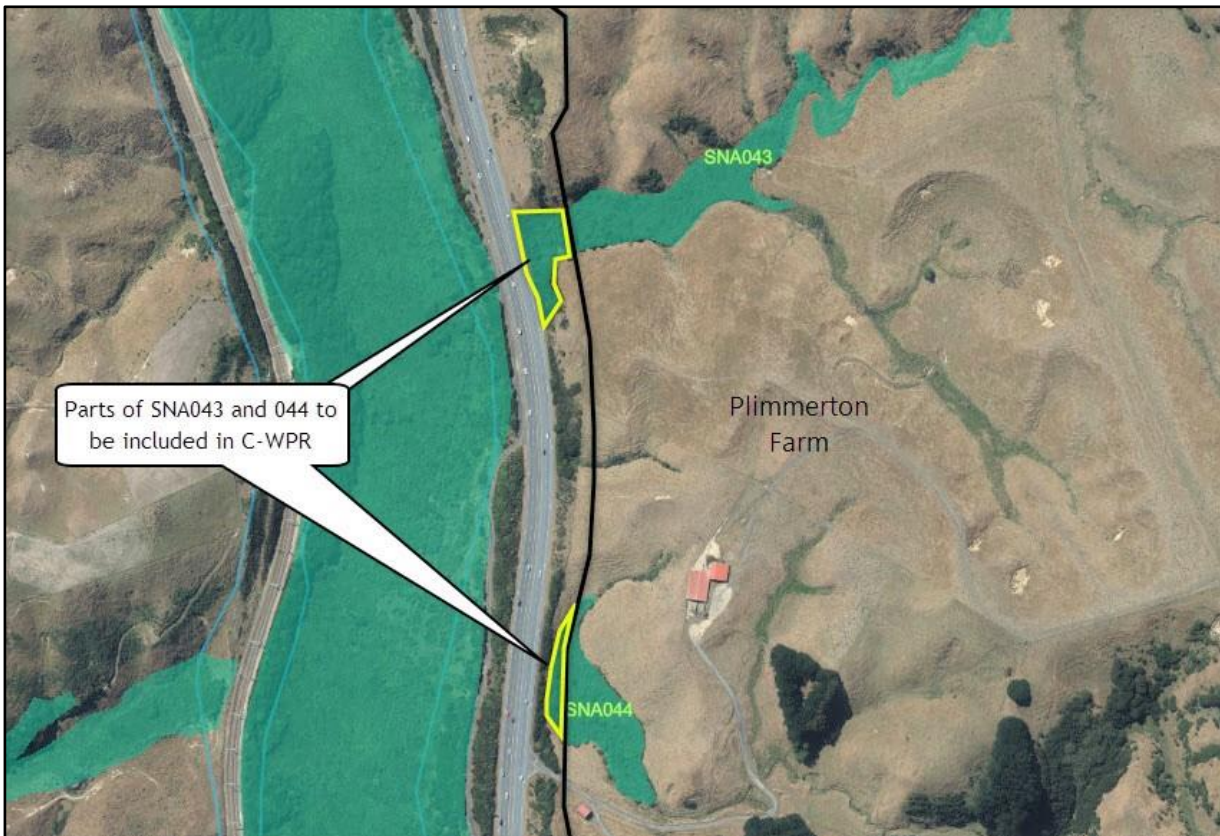
Figure 1: Parts of SNA043 and SNA044 to be included in the C-WPR (outlined in yellow)